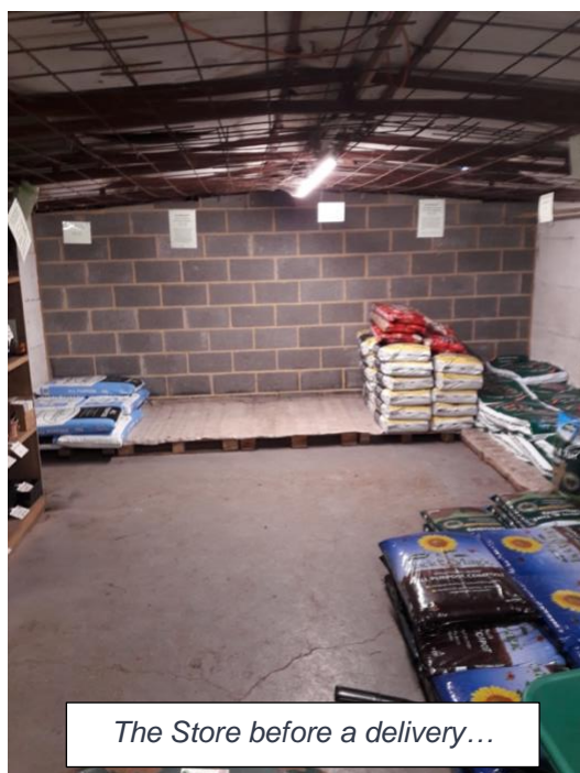
The Store before a delivery...

Many thanks to all our customers who came to the Store and helped us achieve record takings last Sunday. We ran out of Growbags last week, but we will have more going forwards.