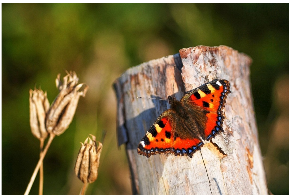
The Small Tortoiseshell had its worst year on record.